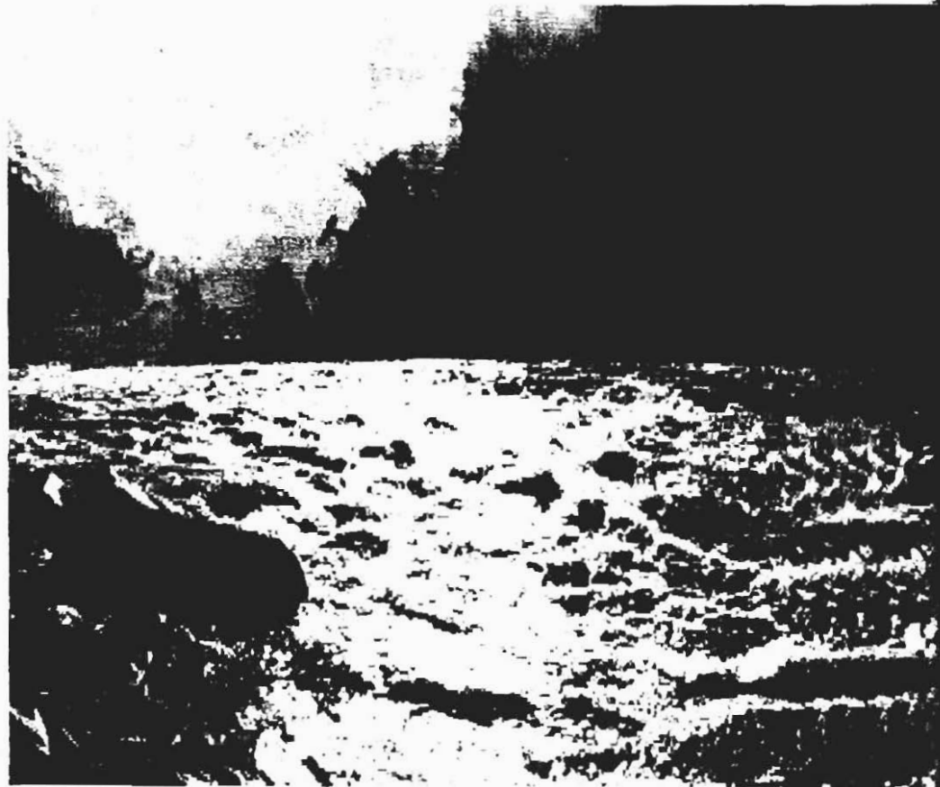
The natural flow of Ganga before Maneri-dam

Crippling the holy Ganges is far too great a sacrifice for the production of a few hundred megawatts of electricity. The power generated from these dams may benefit a select few, but will rob millions of their spirituality, heritage, and drinking water. The Government of India and the Government of Uttarakhand must take immediate steps to free this holy and majestic river from bondage, ensure the uninterrupted flow of the holy river from Gangotri to Dharasu (Uttarkashi), and conserve the heritage of India.