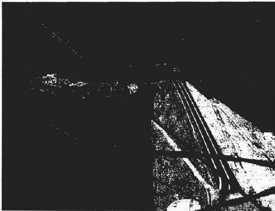
The caged Ganga has lost her natural flow at Tehri-dam